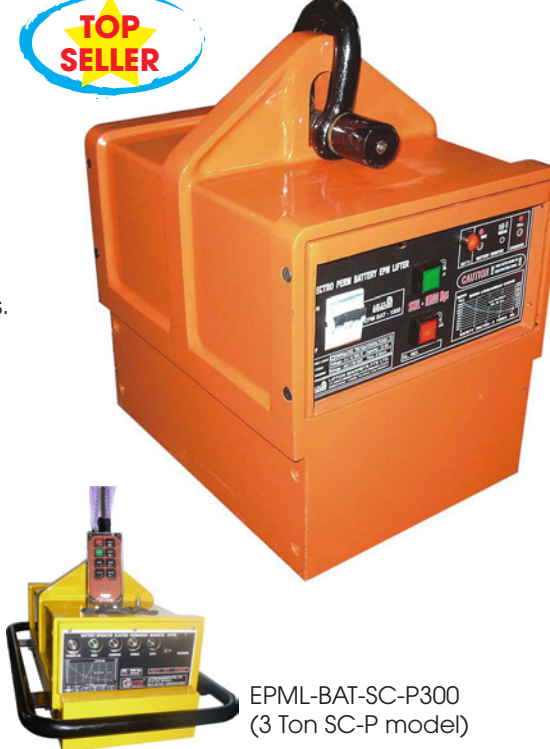
EPML-BAT-SC-600 (6 Ton SC model, 3 Ton round bar)